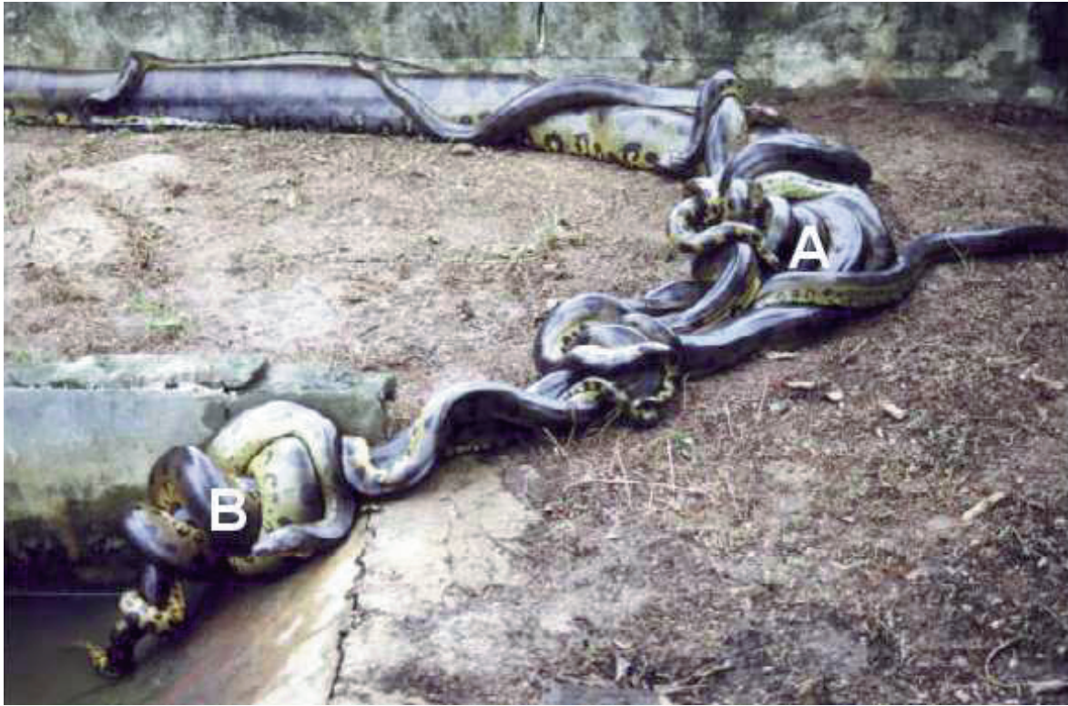
Figure 2. Mating aggregation of anacondas involving a very large female (Ashley) and 11 males. The female moved out of the water and dragged with her some of the males that were coiled around her (A). Other males were removed from their positions and tried to find the female again to continue courtship. However, some smaller males have mistakenly coiled around a very large male and are courting him (B).

562). That size cues by males to the female's presence is also suggested in the report of Noble (1937) on two small male T. sirtalis that, for half an hour, courted a large male from another region where the animals were not reproductively active at the time. In his recent reply to Shine et al. (2000), Crews (2000) argued that the number of males involved in a breeding aggregation may lead to different outcomes in the competition between males; this could be the reason why his results (Joy & Crews 1988) differ from those of Shine et al. (2000). Shine et al. used only a relatively small number of males (perhaps a more common scenario in the mating system of garter snakes throughout North America), whereas Crews