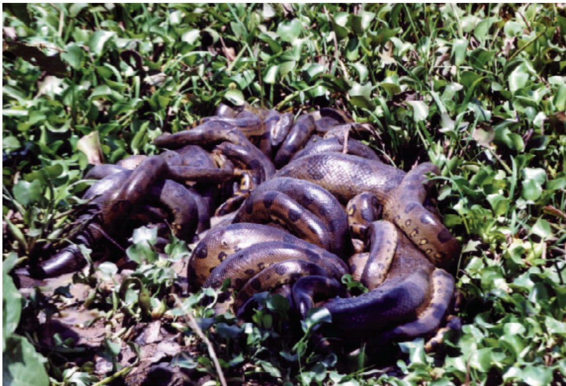
Figure 1. Breeding female anaconda (Ashley, 475 cm TL) at the shore of a lagoon in the Venezuelan llanos, being courted by 11 males.

with him. The result would be that a very large male might have to spend time and effort fighting off other males that might attempt to mate with him. If this is so, in species that mate in large multimale breeding aggregations, smaller male body size could be a cue for sex recognition for other males as well as for the female. A courted male, as well as the males that court him, would be at a disadvantage compared with smaller males that do not mislead other males. This constraint on large male body size may lead to a local size optimum, where males are large enough to win combats with other males in the breeding aggregation, and yet be small enough to be distinguished from breeding females. In those snake species that do show male–male combat, breeding aggregations are not common and sex recognition during courtship is not a selection pressure limiting male size. Thus, selection for large male size in species that engage in male–male combat is fully expressed.