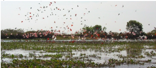
Birds of the Llanos, including the roseate spoonbill and scarlet ibis

The tourist station is also a small biological research station. Other biologists from Venezuela, the US, and various other countries also stay at Hato El Cedral while conducting research, along with various professional wildlife photographers from all over the world. The excursion guides know all of the regional birds and wildlife. This is a perfect place for wildlife watching of all sorts, from giant ant-eaters, capybaras (largest rodent in the world with 120 lbs) to the giant anaconda (the world's largest snake), green iguanas, and Orinoco Crocodiles - they all are pretty sure sightings in this place.