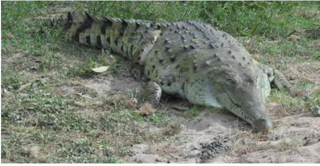
The endangered Orinoco crocodile

Day 7 th : Return from EL Cedral to Caracas. Leave in the morning by taxi to get the flight from Barinas back to La Guaira on the ocean. Enjoy a dinner and an evening along the Caribbean shoreline.