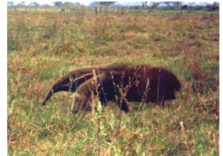
Giant Ant Eaters